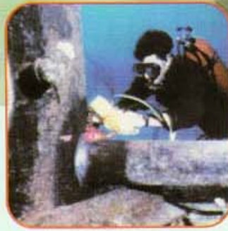
Under Water Inspection